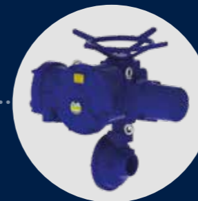
STX SWITCH on a bevel gearbox