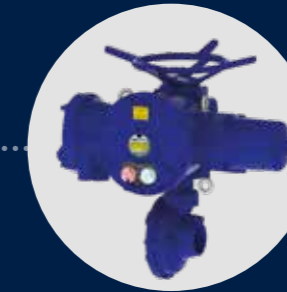
STX INTELLI+® on a bevel gearbox